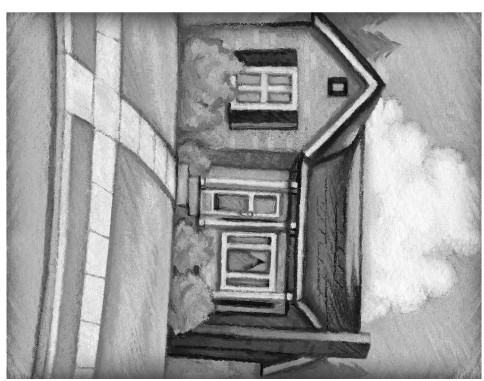
This is a home.