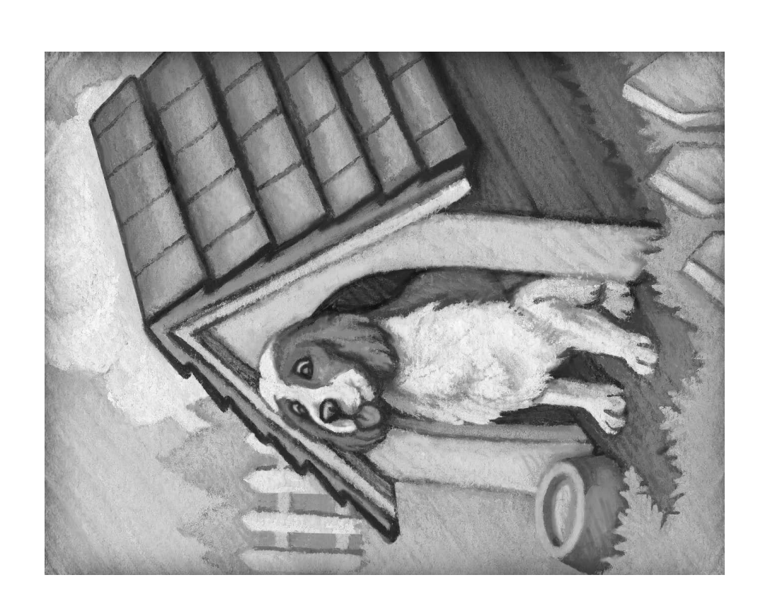
Is this a home?