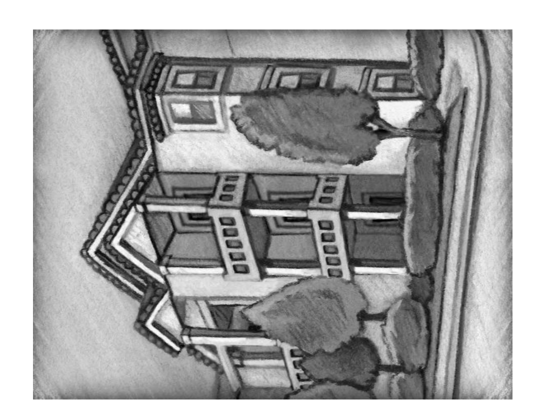
This is a home.