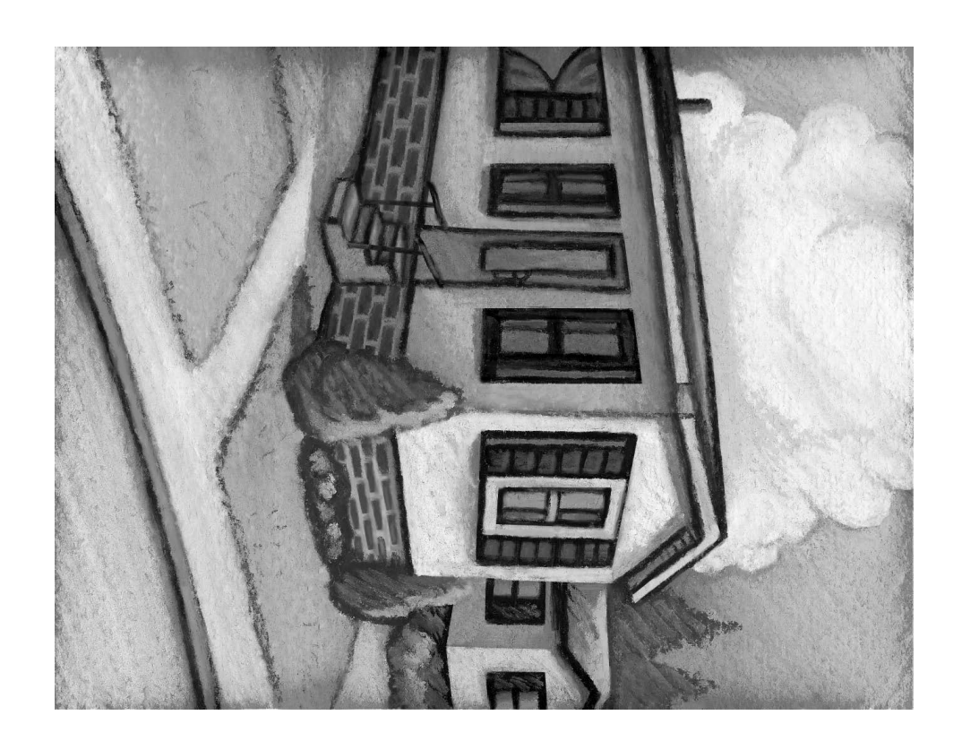
This is a home.