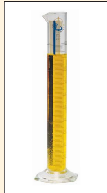
A graduated cylinder is used to find the volume of a liquid.

It is easy to see that a block of wood and milk have both volume and mass. Proving that air has volume and mass is more difficult. You cannot see air, so how can you tell that it takes up space? How can you tell that it has mass? Look at the picture with the balloons. An empty balloon is placed on one side of the balance. The other balloon is blown up and placed on the second side of the balance. The side of the balance with the inflated balloon goes down, showing that air has mass. The air is taking up space within the balloon, proving that air has volume.