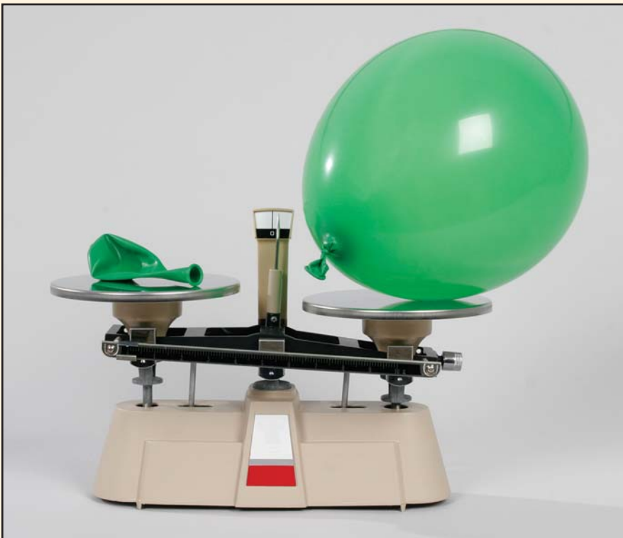
Air has mass and volume.