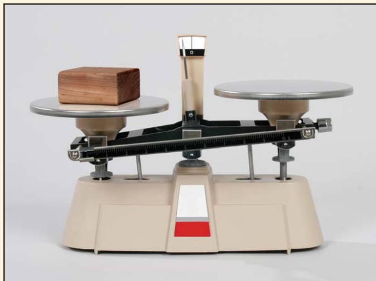
A balance is used to measure mass.

To measure mass, scientists use a balance , like the one pictured below. To find out how much mass an object has, place it on one side of the balance. On the other side, place objects with known masses, like a standard mass . A standard mass is a small