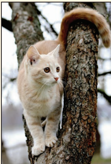
Plants and animals are organisms.

Scientists who study life science are called biologists. Biology is another word for life science. There are so many things for biologists to study that many of them decide to specialize, or study one thing very carefully. For example, zoologists specialize in studying animals, and botanists specialize in studying plants. In this student text, you will learn about the basic biology of plants, animals, and other organisms.