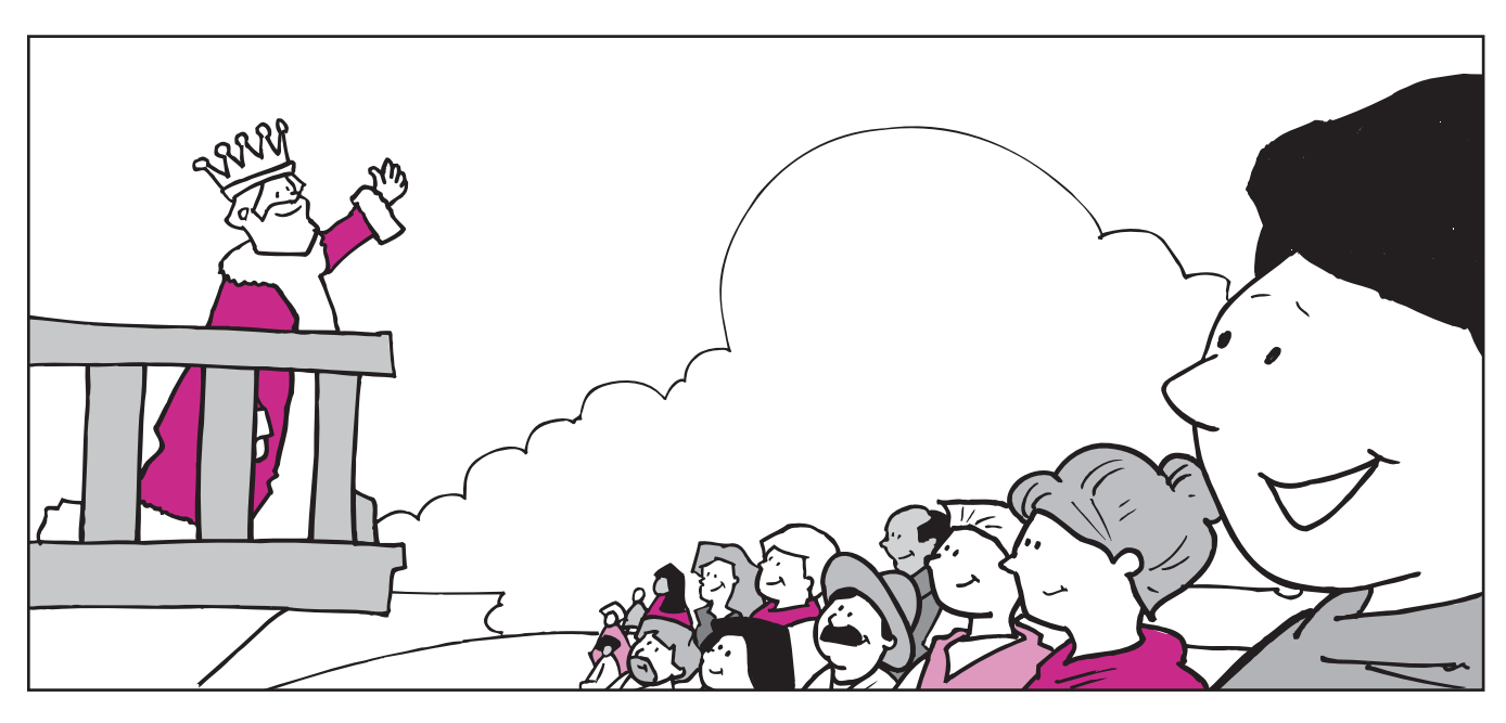
5. From the balcony, the king waved to his public. Where did the king wave from?